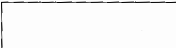
Specimen Signature of the applicant

* Strike off whatsoever is not applicable