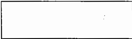
Specimen Signature of the Applicant