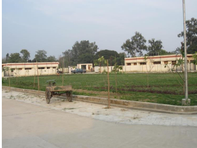
Work in progress at Moradabad

For Phase-II, response for smaller units has been poor. Now depending upon the response of members, the plan has been modified and approved by MDA. Scheme has been reopened from 14-07-2014 including for outsiders. Good response has been received and all vacancies are now filled up. Work on 81 units of Phase-II is in progress. Roof slabs for 13 units have been cast.