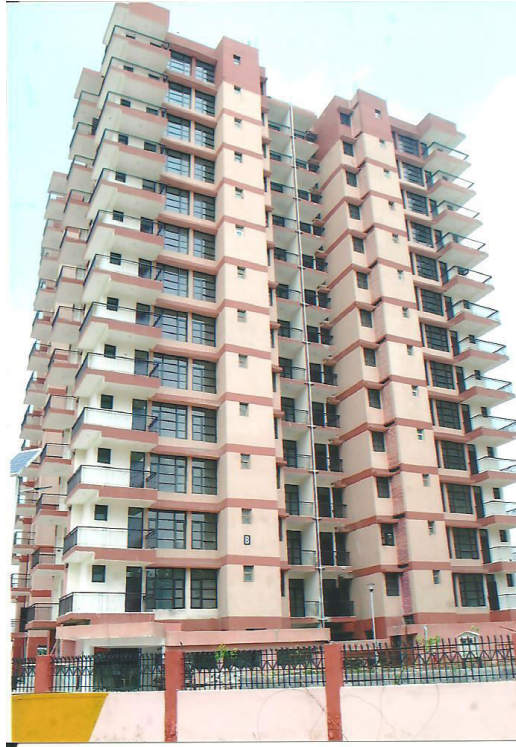
Work in progress at Sonepat

Construction of 660 dwelling units has been planned. In eleven towers which have been taken up in Phase-I, all 260 type-II, 192 type-III and 106 type-IV units, have been completed. Draw of lots for specific unit for Type-II, Type-III and Type-IV units has been held and the results have been uploaded on IRWO website. 416 dwelling units have been handed over to the allottees. Phase-II scheme has also been completed. Draw of lots for specific unit was held on 16-05-2015 and results uploaded on IRWO website. 1 unit has been handed over.