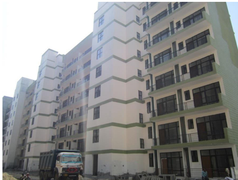
Work in progress at Zirakpur

A new Contract for the work including Phase-II work has been awarded in August, 2012 after terminating the contract fixed in June, 2010 due to slow progress. Work has been restarted and is progressing in full swing. All 195 roof slabs have been cast