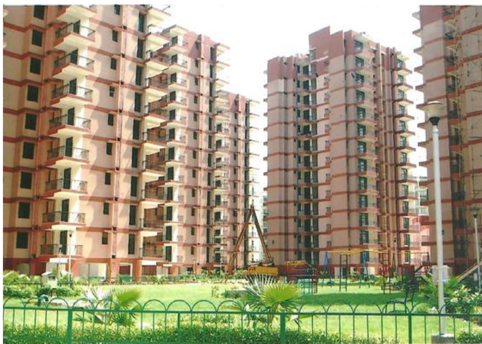
Work in progress at Sonepat

Construction of 660 dwelling units has been planned. In eleven towers which have been taken up in Phase-I, all 260 type-II, 192 type-III and 106 type-IV units, have been completed. Draw of lots for specific unit for Type-II, Type-III and Type-IV units has been held and the results have been uploaded on IRWO website. 432 dwelling units have been handed over to the allottees. Phase-II scheme has also been completed. Draw of lots for specific unit was held on 16-05-2015 and results uploaded on IRWO website. 11 units have been handed over.