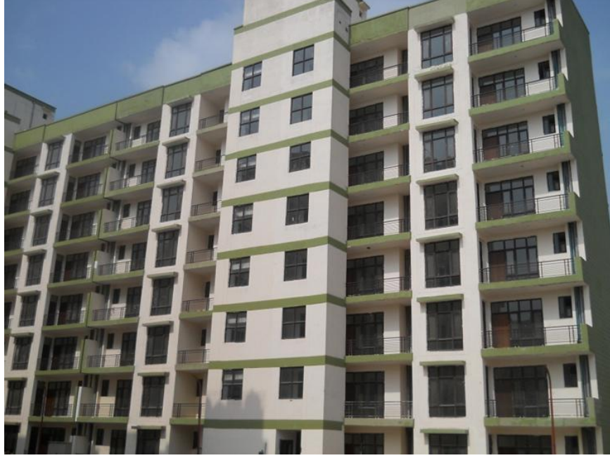
Work in progress at Zirakpur