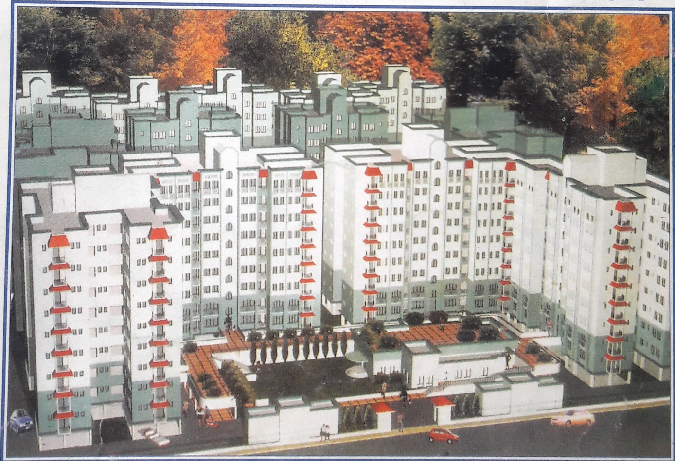
RAIL VIHAR, KOLKATA, PHASE-IIIB